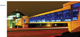
The St. Louis Science center proudly supports recycling.

Within the St. Louis area, Republic Services supports and services a number of local events and attractions: